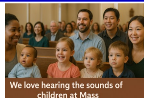
We love hearing the sounds of children at Mass

Just as an athlete prepares for a race with months of regular training, so does the practice of penance prepare a Christian for the 'though' side of Gospel living; those days that require you to 'give your all' when you thought you had already.